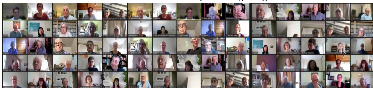
Our December 'Connection' participants