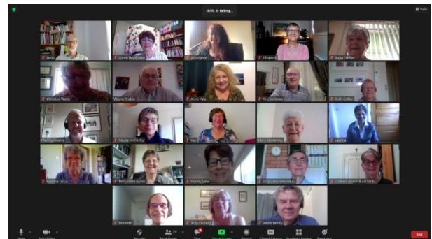
Members Connecting in November 2020

There was the promise of fulfilment of deeper faith and the readiness for passionate engagement with wider society and eagerness to share the gifts of Ignatian Spirituality.